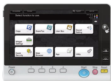
10.1" Colour Touch Screen with NFC authentication