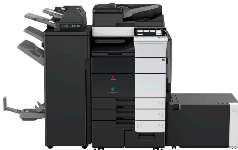
Configuration with FS-537SD Finisher combined with PI-507 Post-inserter, RU-515 Relay Unit and LU-205 Side Drawer