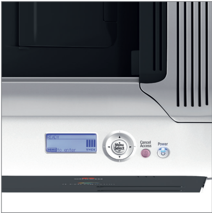
4-line LCD operator panel