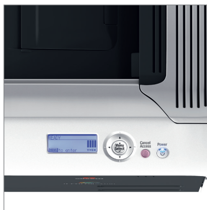
4-line LCD operator panel