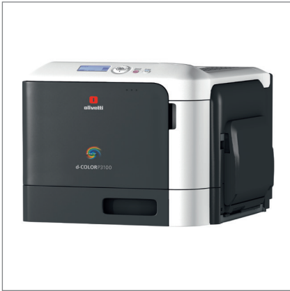
Professional A4 colour printer with stylish design