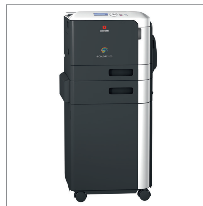
3 input paper trays (optional)