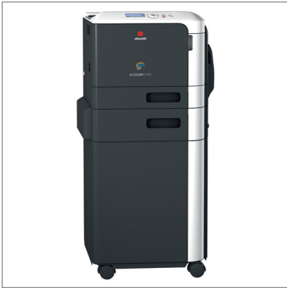
3 input paper trays (optional)