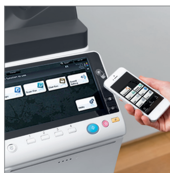
New 10.1" Touch-screen and NFC Authentication Area