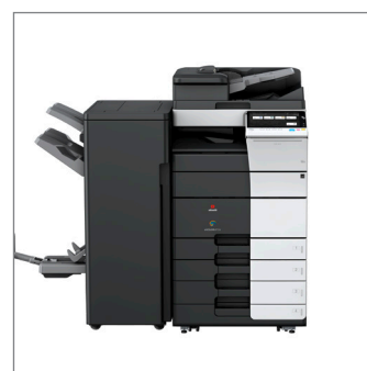
Configuration with SF-537SD Finisher, PI-507 Post-Insert, RU-513 Connection Unit, PC-215 Drawers, LU-207 Side Drawer